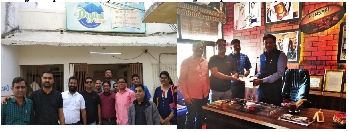
Fig: 9: Punsari Village Visit