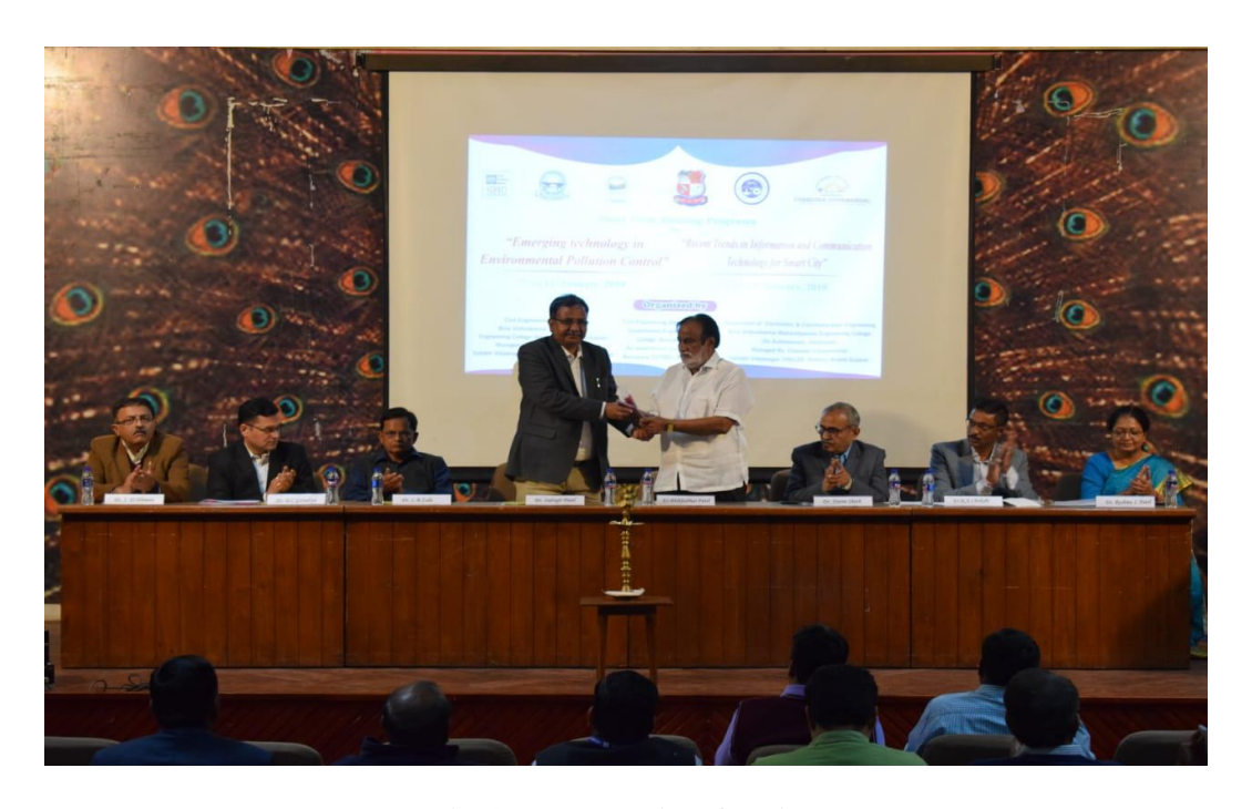
Fig.1: Inaugration funtion