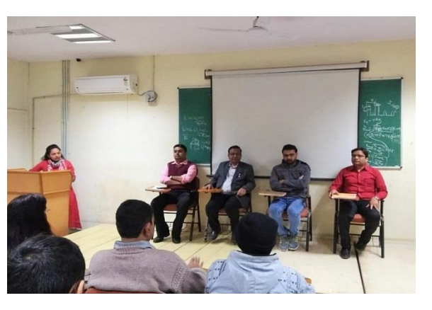
Fig:12: Velidictory Fuction