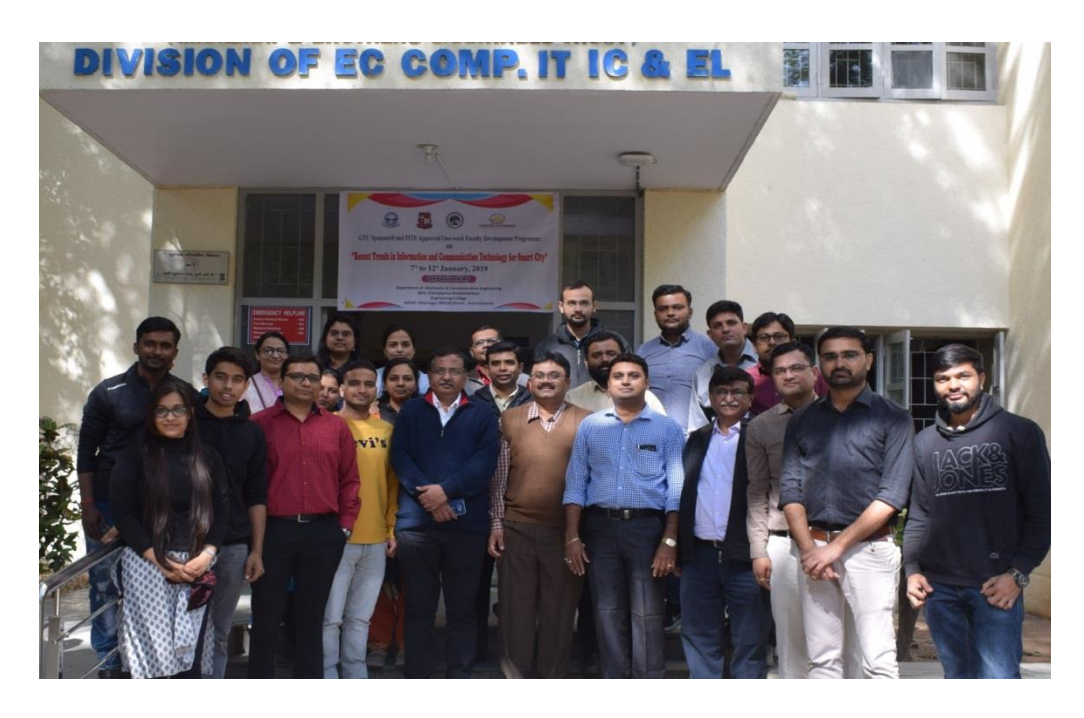
Fig.2: Group photo of FDP