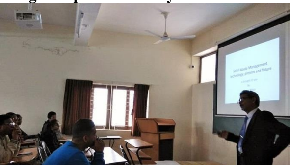
Fig:6: Expert Session by Mr.Arunav